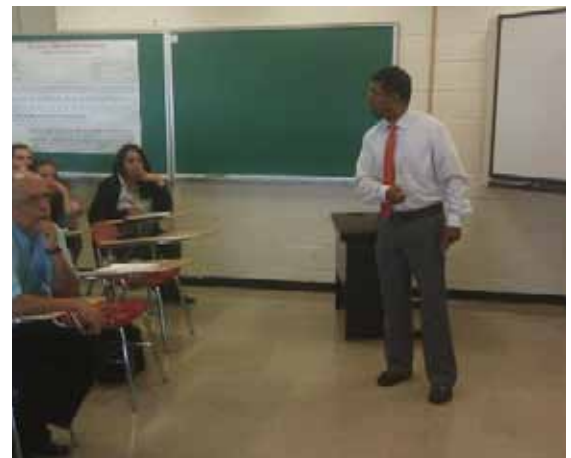
Geospatial workshop for multidisciplinary BCC faculty and students on October 28, 2010.