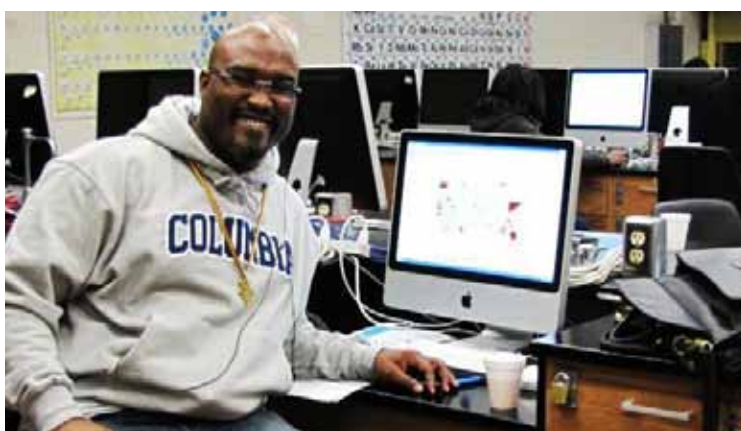
Geospatial workshop for multidisciplinary BCC faculty, students and staff held on December 7, 2010